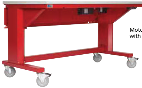
Motorized Base rear-justified with optional casters