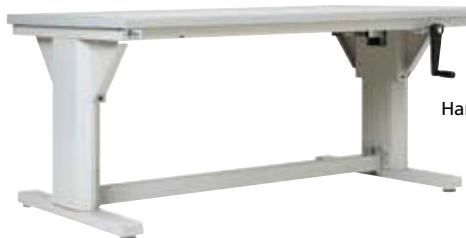
Hand crank Base center-justified