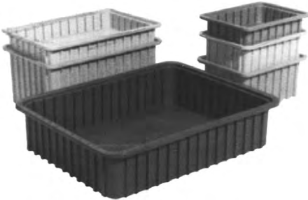
assorted divider tote boxes