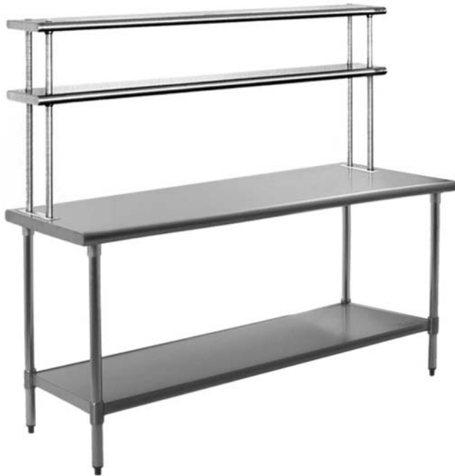
worktable shown with Flex-Master® overshelf system

Eagle Flex-Master® Overshelf System to consist of 10"- or 12"- wide shelves—16/430 or 16/304 stainless steel, adjustable in 1" increments without the use of tools. Shelves feature split sleeves with a tapered collar for mounting onto posts. Stainless steel posts include mounting plates. Optional stainless steel pot hooks and utility racks available.